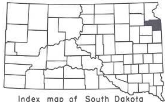
Index map of South Dakota showing location of Grant County