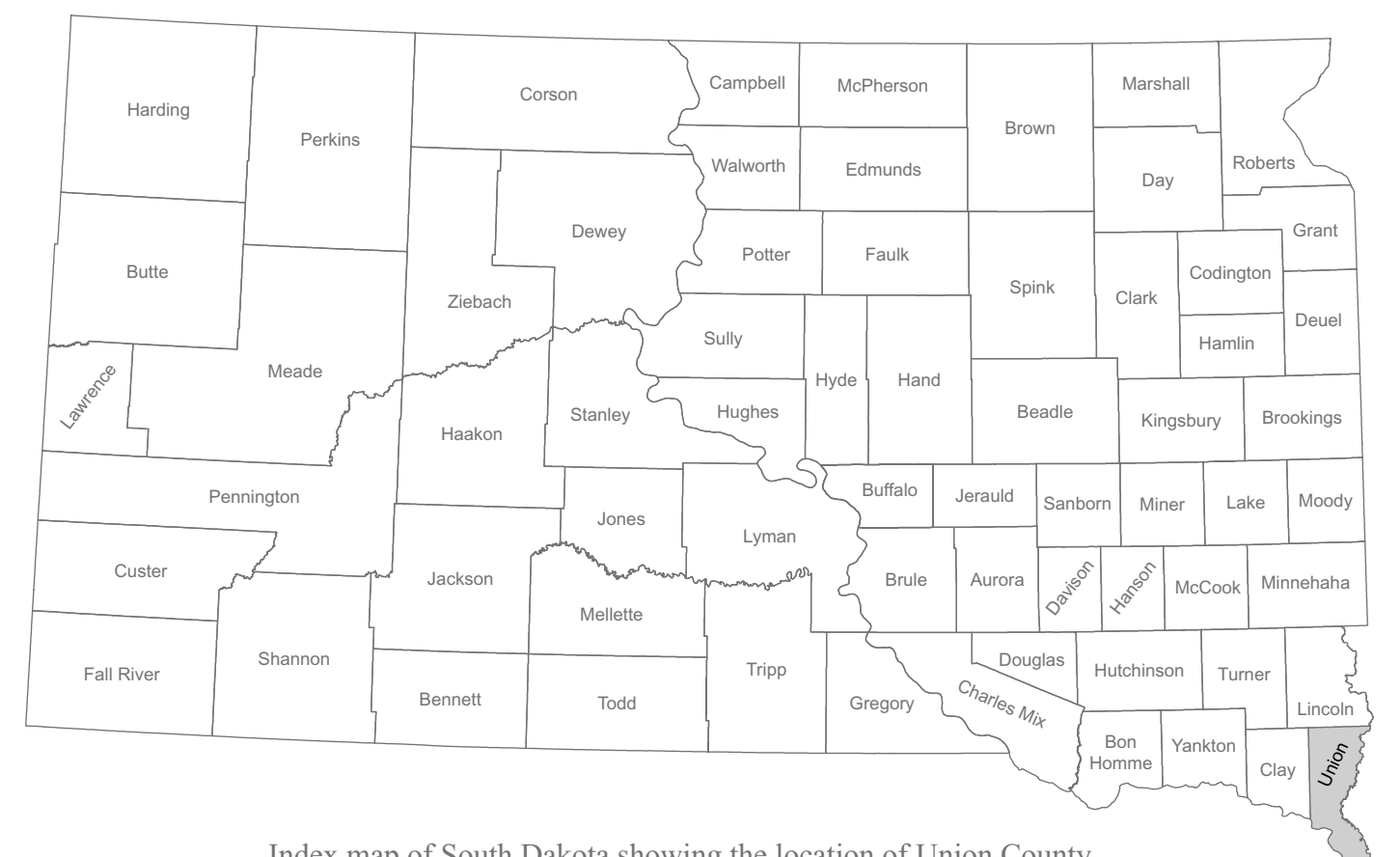
Index map of South Dakota showing the location of Union County

The Geological Survey, Department of Environment and Natural Resources, engages in an ongoing data collection and interpretation process. An outcome of that process is to reflect those interpretations on maps such as this one. Reasonable efforts have been made to ensure that this map accurately reflects the source data used in its preparation. This map is date specific. As additional data become available, geologic interpretations may be revised and the map may be updated by the Geological Survey. This map should not be enlarged or otherwise used in an attempt to interpret more detail than can be seen at the 1:100,000 scale.