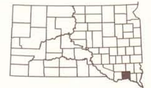
Index map of South Dakota showing location of Yankton County.