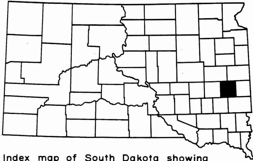
Index map of South Dakota showing location of Lake County.