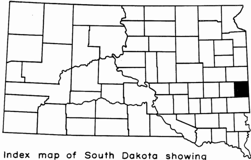
Index map of South Dakota showing location of Moody County.