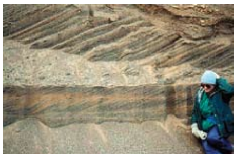
Figure 3: Glacial Outwash (sand and gravel)

In eastern South Dakota, glacial outwash aquifers are very important. Figure 3 shows an unsaturated portion of a glacial outwash in a quarry. There are approximately 444 public water supply systems east of the Missouri River and 392 of them utilize glacial outwash aquifers. In contrast with the bedrock-type aquifers such as the Deadwood Formation and Dakota Sandstone, glacial outwash aquifers