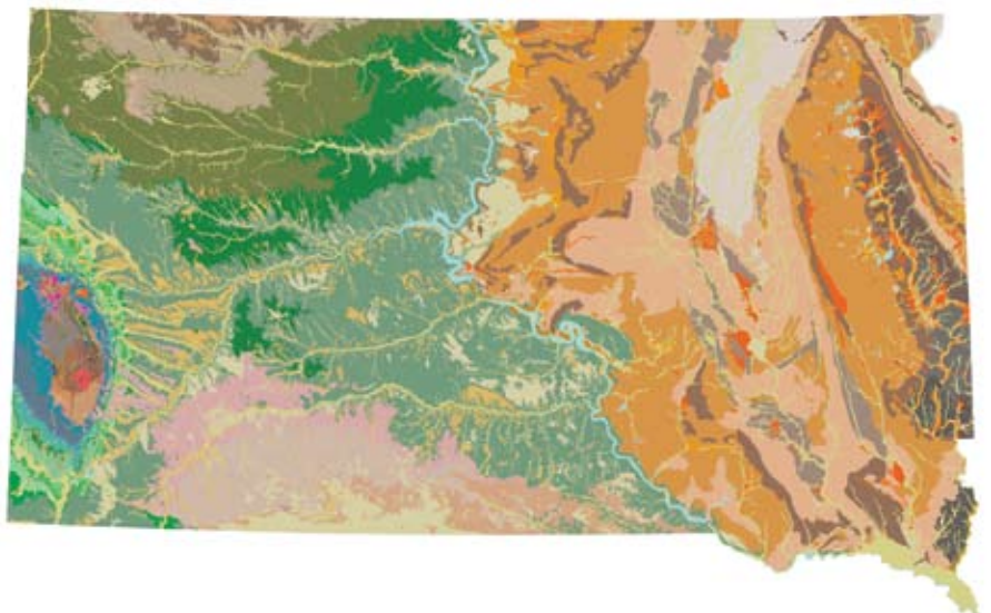
Figure 1: Surface Geology of South Dakota. Map available at: http://jurassic2.sdgs.usd.edu/pubs/pdf/G-10-text.pdf

The Deadwood Formation, which occurs at land surface or at relatively shallow depths around the periphery of the Black Hills, is a source for private water wells there. The Deadwood Formation dips quickly below land surface, however, away from the Black Hills and in northwest Harding County this unit is nearly 9,000 feet deep (figure 2) and the quality of water it contains there is highly mineralized. In this example, the depth and water